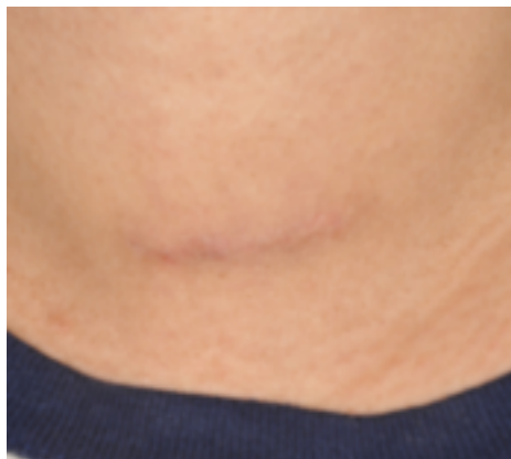
Fig 3. A well healed incision post-op