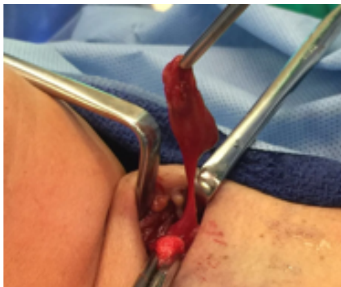
Fig 2. A large left inferior parathyroid adenoma was identified.